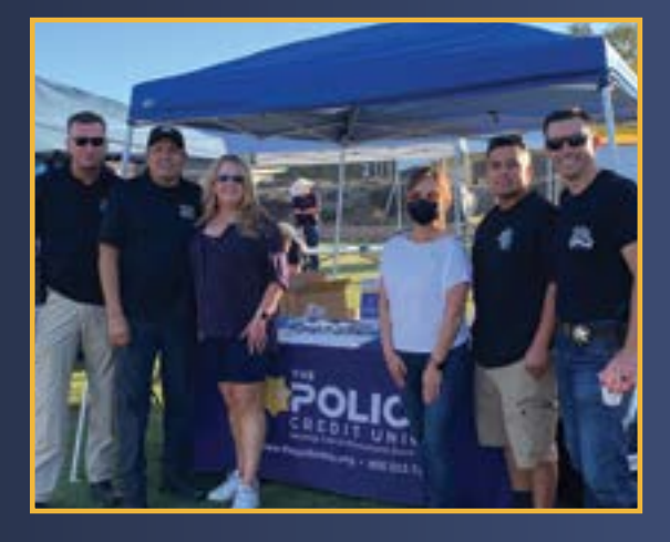
Ventura County Deputy Sheriffs' Association Department Shoot and BBQ