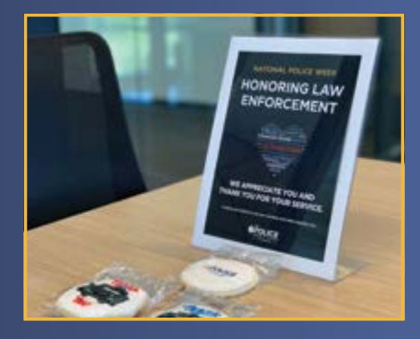
Police Week - Honoring Law Enforcement