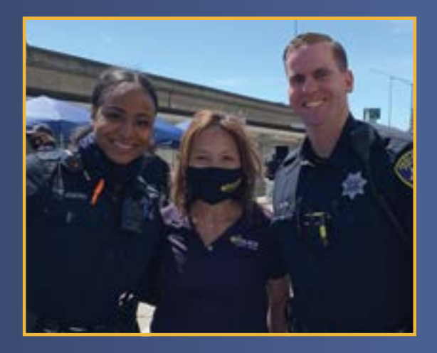
Oakland Police Department Officer Appreciation Event