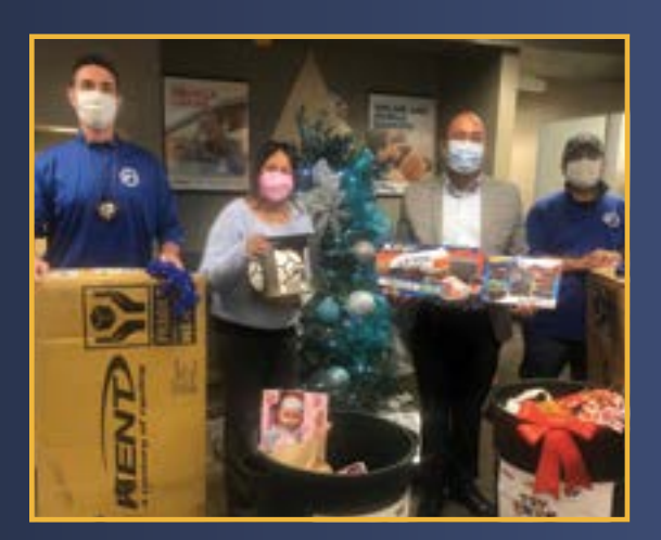
SFPAL Toy Drive